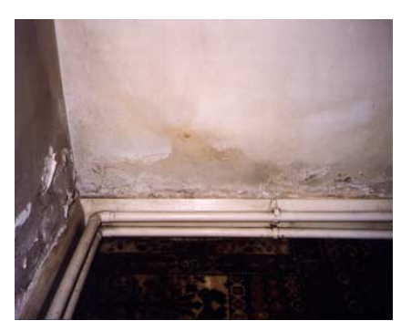
Typical rising damp stain on internal wall