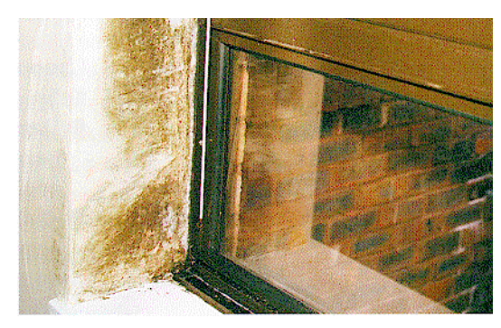
Typical example of mould caused by condensation