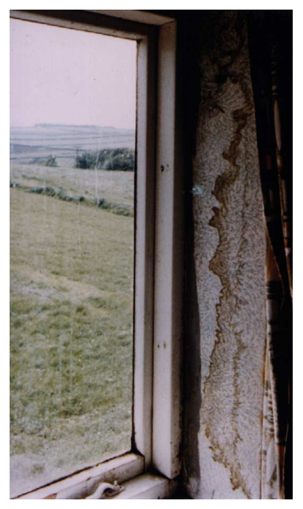
Rain penetration at a window jamb