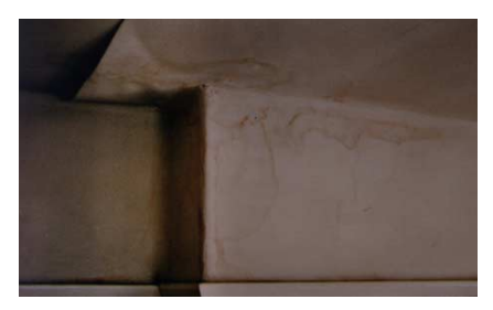
Staining to ceiling caused by rain penetration of chimney stack