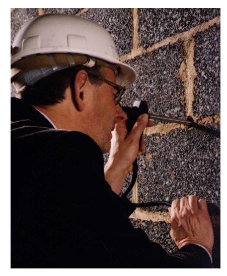
Using an optical probe to investigate hidden dampness in a cavity wall

At a more humble level, a sheet of kitchen foil can help to distinguish between rising damp and condensation as the cause of dampness in a solid floor. Put half a square metre of foil on the floor — underneath the carpet/underlay if there is one — and seal round the edges with adhesive tape. If, next day, moisture has collected on the underside of the foil, there is dampness in the slab. If there is moisture on the upper surface, condensation is occurring.