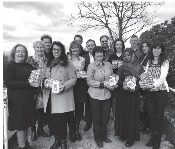
Figure 3. The selection panel for the KUBR 2016.

The six publishers responded variously: one very enthusiastically by return of email; one soon afterwards in similar vein, including a quoted enthusiastic response from the author, one over two weeks later after having