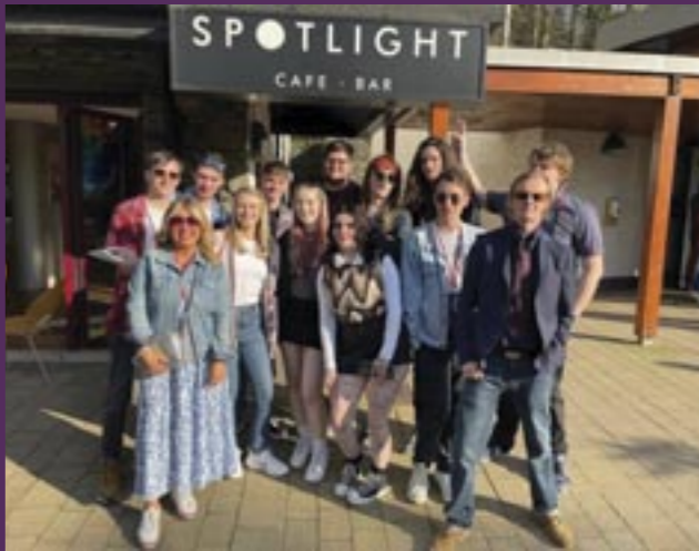
An innovative scheme set up to help young filmmakers with the first steps of their careers has won a national Kickstart Award. The Institute for Creative Enterprise (ICE) at Edge Hill University established 21 Media to create a route into the industry for 16- to 24-year-olds on Universal Credit who are at risk of long-term unemployment. Having been funded by the Government’s Kickstart scheme, 21 Media has now been chosen for an award out of thousands of entries in the Innovative Employment and Support for Young People category.

“ 21 Media gives under-represented voices in film a voice, it shows working class young people shining as they should .”