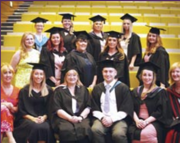
The North West’s first cohort of BSc (Hons) Nursing Apprentices celebrated their graduation – and new jobs. Apprentices on the trailblazing new adult nursing degree have excelled in their studies, with many of them already working in their new profession, thanks to the partnership between Edge Hill and St Helens and Knowsley Teaching Hospitals NHS Trust (STHK).