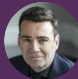
Andy Burnham Mayor of Greater Manchester

“I'd like to thank all of Edge Hill's health students to whom we all owe a debt of thanks . The students are a credit to both their lecturers and the NHS.”