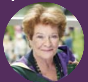
Dame Janet Suzman DBE Actress and Edge Hill Honorary Doctor

“I have seldom read a play so spare, so threatening, so apt for the times we live in... It ought to be sent to The Royal Court before too long as it's so timely.”