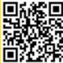
watch the event

The event is available to watch on the University's YouTube channel.