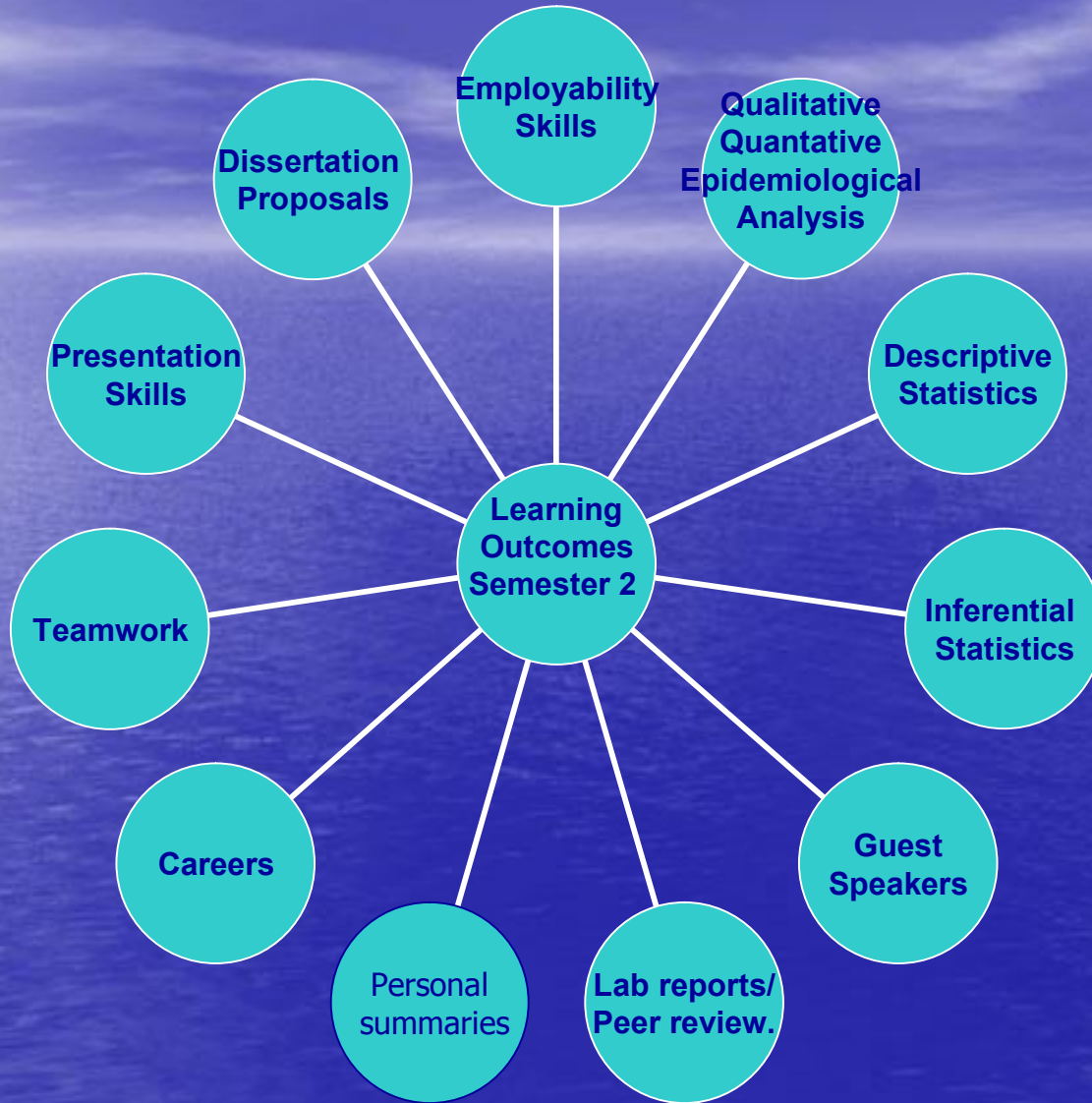
Semester Two Model Hepworth (2005)