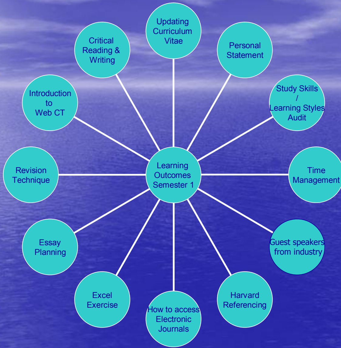
Semester One Model Hepworth (2005)