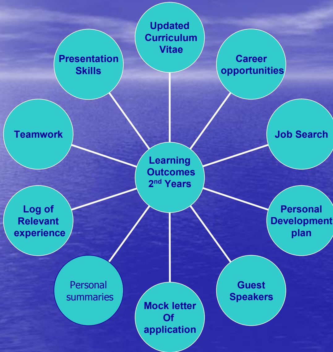
Semester Two Model Hepworth (2005)