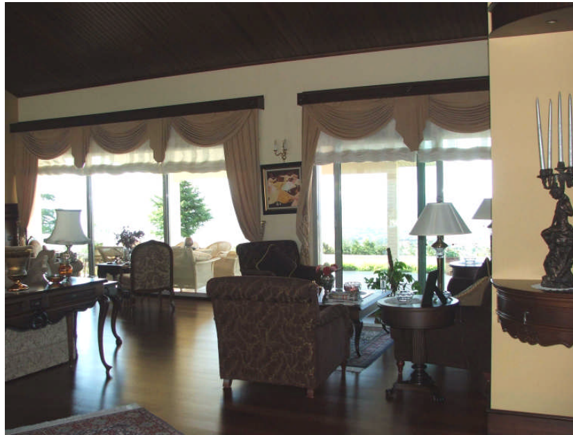
Figure 3: Framed views of the landscape.