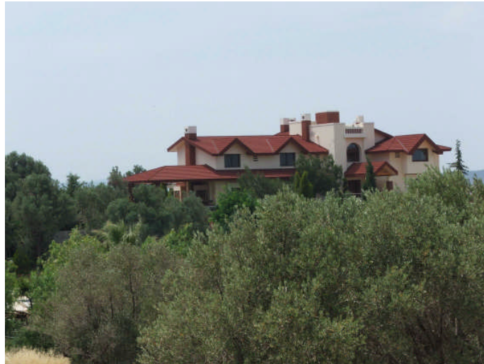
Figure 2: Photograph of one site house.

migration of American and European military personnel and their families into this city each year. The NATO officials and their families bring with them not just consumer goods from other parts of the world, but also expectations of lifestyle. The architecture of the sites with their detached luxury houses with gardens set in gated communities with swimming pools, gyms, and views of the surrounding landscape are situated at specific intersections of these global flows and networks of people, ideas, and goods. Their 'familiar' rather than unusual designs leads to the reinforcement and representation of 'the global myth of the ideal home as the embodiment of a middle-class way of life' (Oncu, 1997, p61).