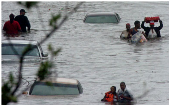
Figure 5: New Orleans residents try to find dry ground.