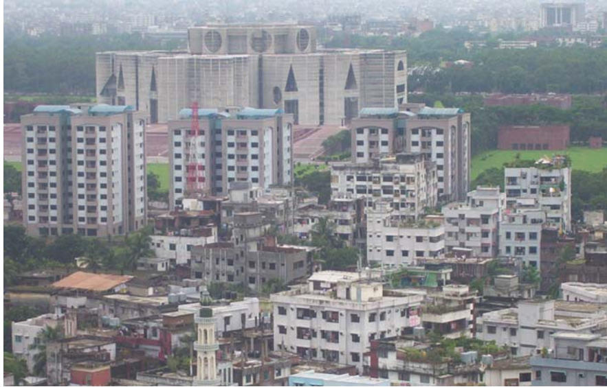
Figure 2: Louis I Kahn's National Assembly building amidst high rise private sector housing development in Dhaka, Bangladesh.

During my long break in Bangladesh I take a short trip to Khulna (probably third or fourth largest city in Bangladesh), which compared to Dhaka is for me still an archaic medium sized town of the 1960s and the 1970s India, endearingly theorised by Rondonelli's ' growth pole ' centres of the emerging third world (Rondonelli, 1983). Located less than 200 miles from Dhaka you feel that you have been suddenly thrown into an agrarian society reminiscent of the 1960s Green Revolution development of India (see figures 3 and 4). Like many other developing nations, Bangladesh still remains a very unequal society with an increasing difference between the primate capital city and the rest of the country, not to mention the existing internal inequality that tends to widen in Dhaka.