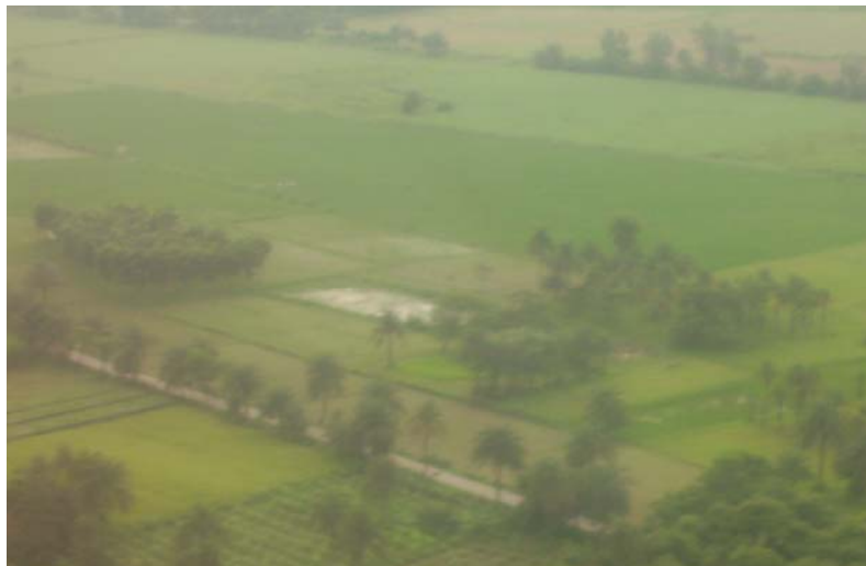
Figure 3: Agricultural land close to urban area of Khulna.

During my long break in Bangladesh I take a short trip to Khulna (probably third or fourth largest city in Bangladesh), which compared to Dhaka is for me still an archaic medium sized town of the 1960s and the 1970s India, endearingly theorised by Rondonelli's ' growth pole ' centres of the emerging third world (Rondonelli, 1983). Located less than 200 miles from Dhaka you feel that you have been suddenly thrown into an agrarian society reminiscent of the 1960s Green Revolution development of India (see figures 3 and 4). Like many other developing nations, Bangladesh still remains a very unequal society with an increasing difference between the primate capital city and the rest of the country, not to mention the existing internal inequality that tends to widen in Dhaka.