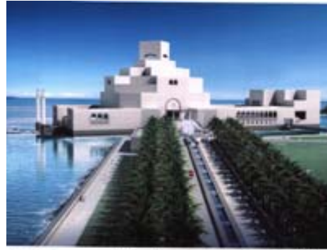
The Museum of Islamic Art, Doha, designed by the Chinese American architect I.M. Pei.