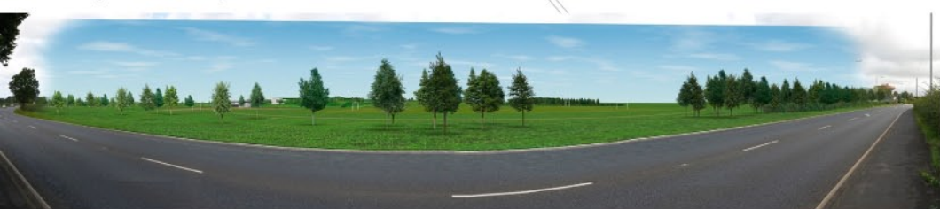
Viewpoint 11. Proposed view across new athletics track towards new sports centre and beyond