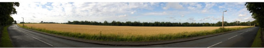
Viewpoint 2. Existing view from ruff lane looking south west across field to existing plantation and flood lighting columns beyond