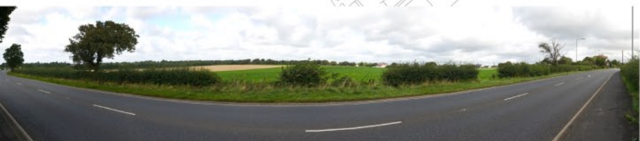
Viewpoint 11. Existing view northwards across farmland towards Ruff Lane