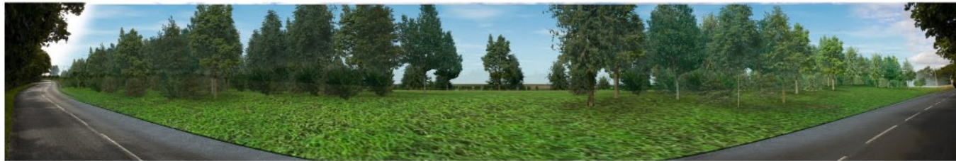
Viewpoint 2. Proposed view with new building and sports facilities screened by landform and plantations