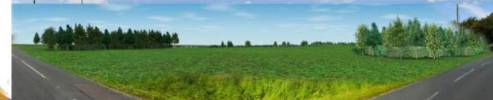
Viewpoint 7. Proposed view of farmland with church view retained