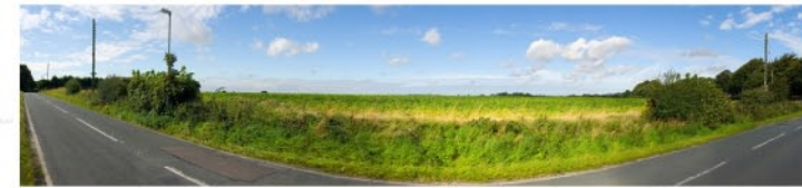
Viewpoint 7. Existing view west of open farmland with distant view of Christ Church, Aughton, in the background