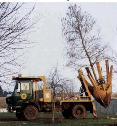
The use of specialist machinery is essential for efficient progress – a tree spade in operation