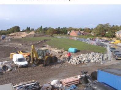
Disruption and impact of works can be minimised if the contract is well managed