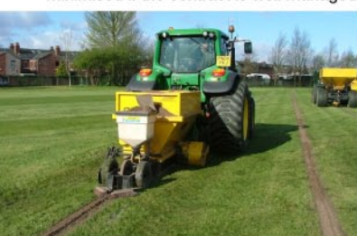
Installation of sand slits, for improved drainage, in a newly formed sports pitch