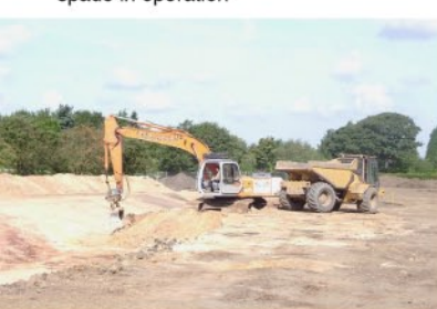
Major earthworks during construction of lake on western campus