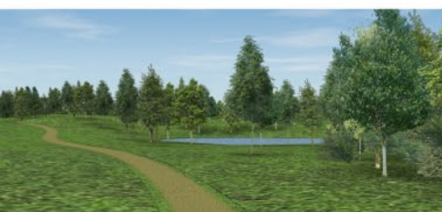
Artist's impressions and design begin the process of change which will ultimately lead to the new facilities

A specialist team of consultants is helping the University to ensure that the design is developed in a way that will maximise its cost effectiveness while at the same time, delivering a sustainable answer through a process which limits environmental impact.