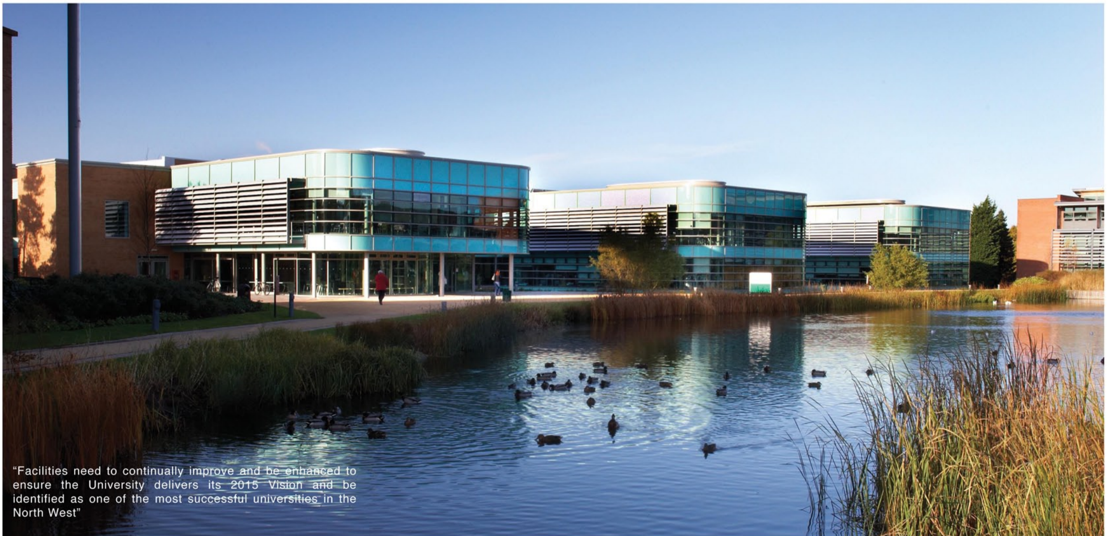
"Facilities need to continually improve and be enhanced to ensure the University delivers its 2015 Vision and be identified as one of the most successful universities in the North West"