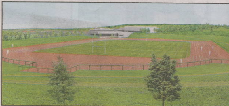
● New artificial sports pitches, the athletics track and the new entry way into Edge Hill University's sports